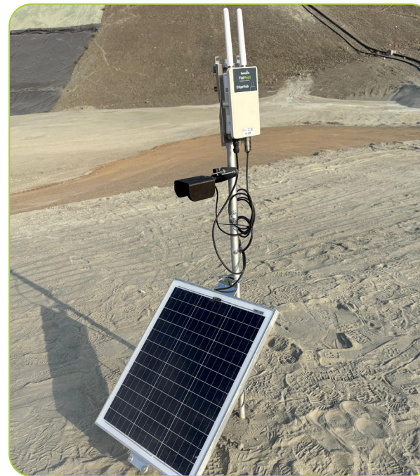
A FlatMesh camera was installed to provide automated imaging, day and night