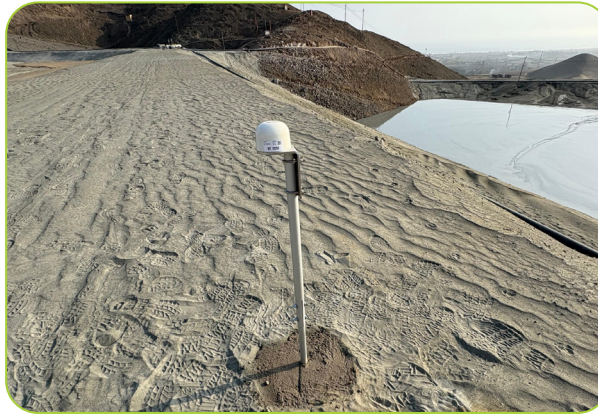
FlatMesh NanoMacro Tilt Sensors, mounted on metal stakes detect any near-surface rotational movement