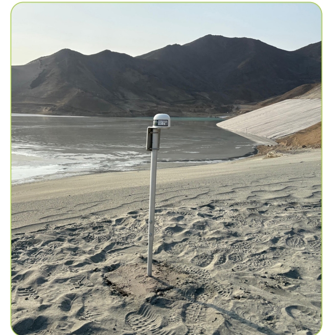
Wireless monitoring system deployed to provide continuous, near real time insight into slope behaviour of the tailings dam